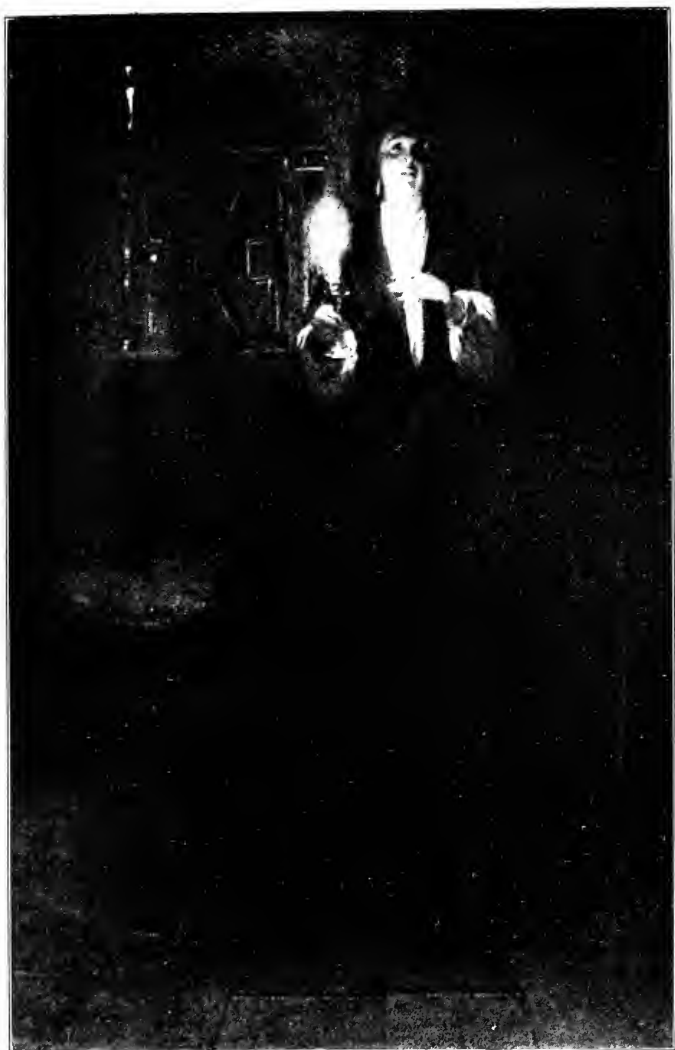
One instant I saw her very clearly, in the light of a candle.